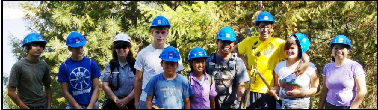
St. Therasas Youth Group performing trail maintenance at Cold Springs Trail at Dworsahk Dam and Reservoir on National Public Lands Day